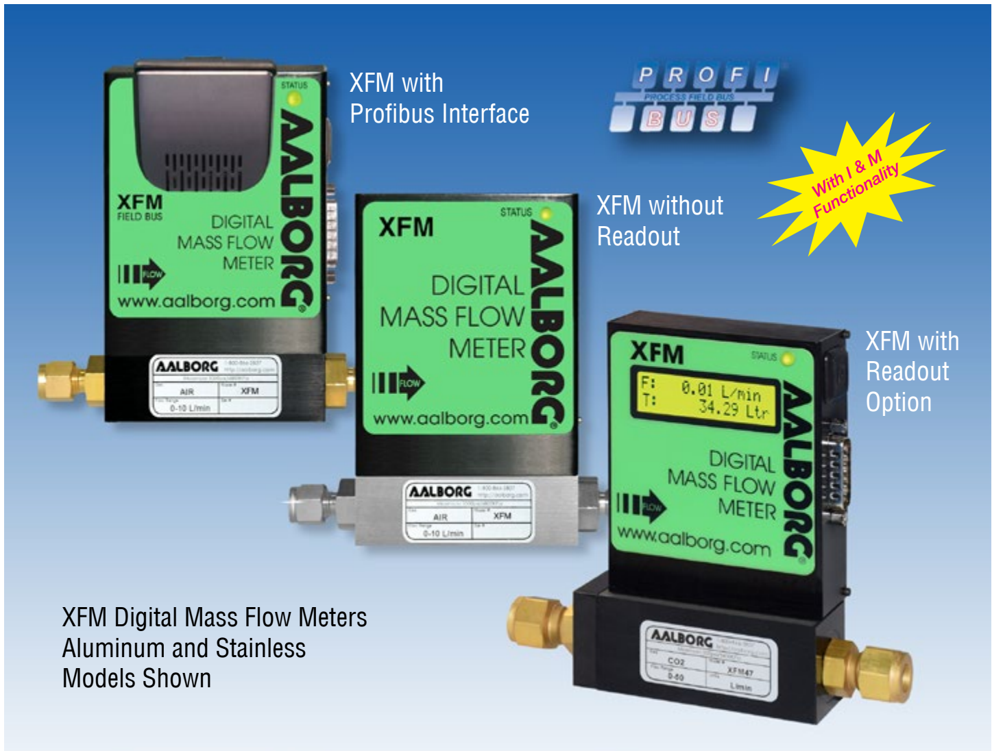
XFM Digital Mass Flow Meters Aluminum and Stainless Models Shown

* LCD display is not available for Profibus DP interface option.